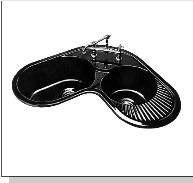
Parisiennes Kitchen Sink ( 212-2044 ).