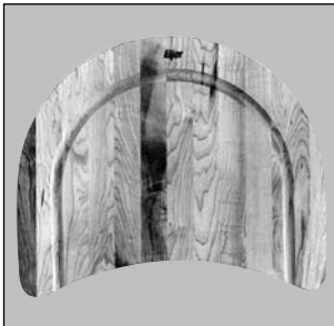
282-2040 Hardwood Cutting Board