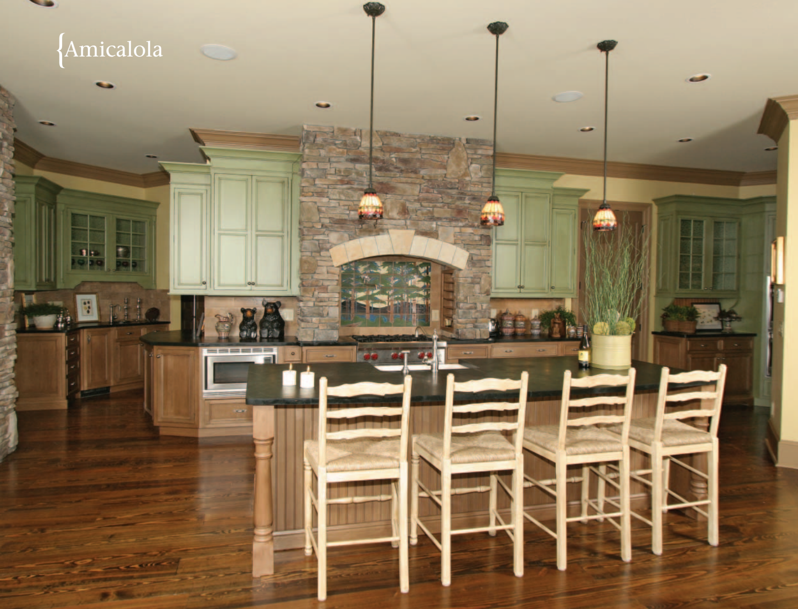
ABOVE: The spacious kitchen includes such amenities as a butler's pantry, working island snack bar, a wealth of cabinetry, and stone encasements above the stove and around the blended refrigerators. RIGHT: The arched trusses of the cathedral ceiling highlight the lodge room and its wall of windows.